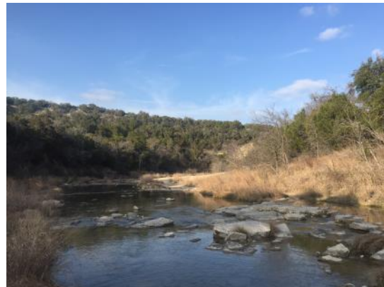
February Campout at Dinosaur Valley State Park