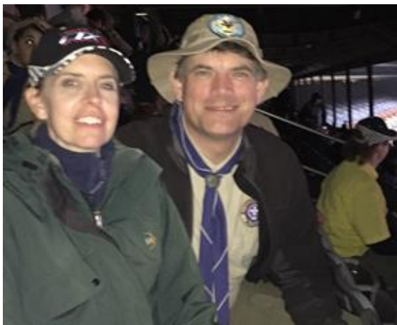
Happy Holidays from the Leonards!