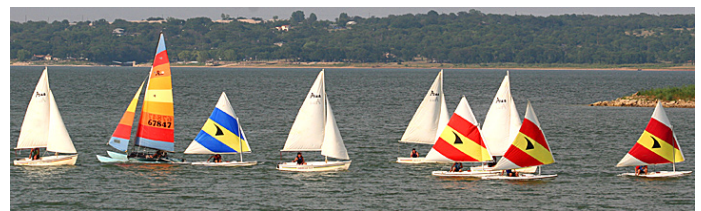
Sid Richardson Scout Ranch will have 30 Sailboats in 2013!

Once a Scout is signed up, refunds can only be considered based on subsequent sign-ups