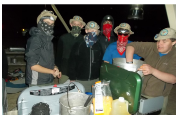
Bandits cooking at Monahans

Take some time and ask a Scout about the journey, they should have many interesting stories to tell.