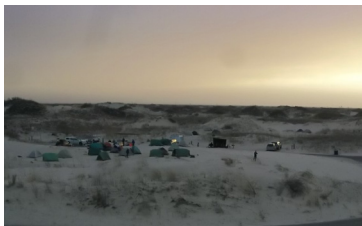
Our camp in the sand at Monahans