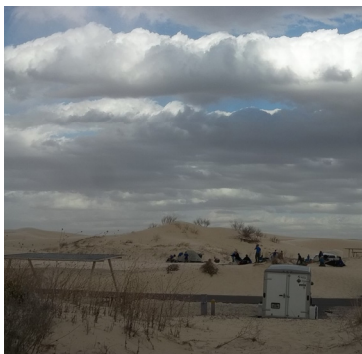
Monahans Sandhills State Park

Take some time and ask a Scout about the journey, they should have many interesting stories to tell.