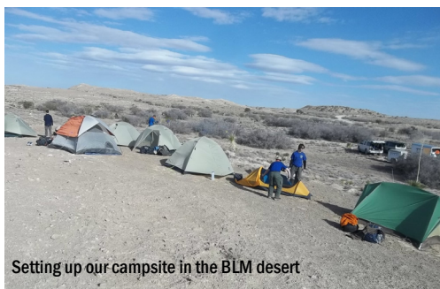
Setting up our campsite in the BLM desert