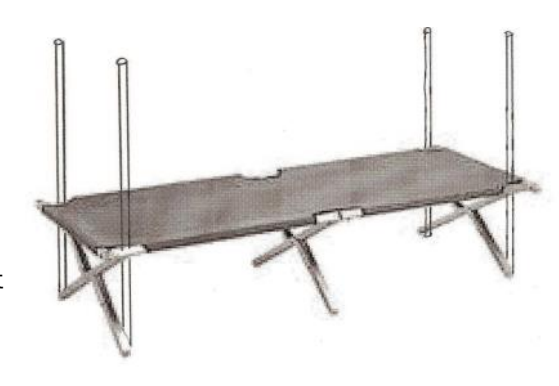
The net is then hung over the four poles.