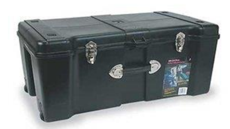
Footlocker / Trunk

I am told that these, normally available at Academy and Walmart, may be sold out at retail, and some out-of-stocks may be caused by the port slowdowns on the coasts. Don't delay!