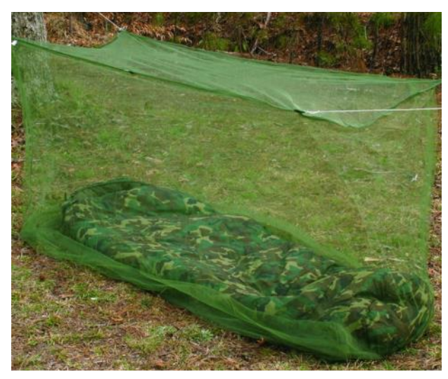
Snugpak Mosquito Net - Single

Like ALL items going to ANY campout — make sure you label each of the poles and netting — as all these items tend to look alike when spread out on the tent floor or scattered after falling out of a cot bag in a trailer.