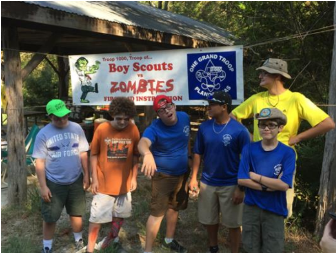
Webelos Woods: Boy Scouts vs. Zombies. Teaching Webelos mostly everything they need to know about First Aid.