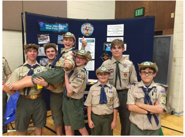
Meet the Troop Night: Putting in good word about T1000!